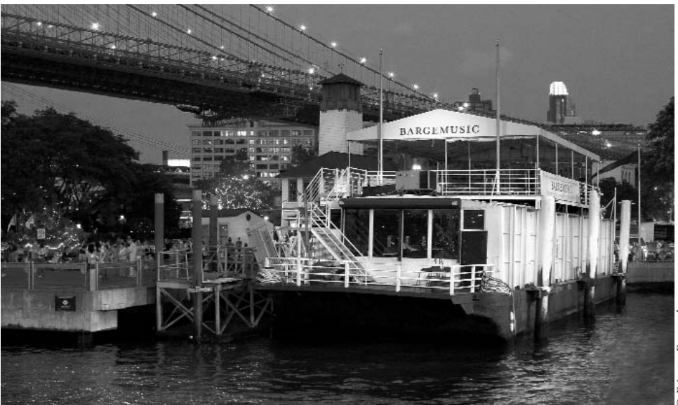
A view of Bargemusic from Pier 1.