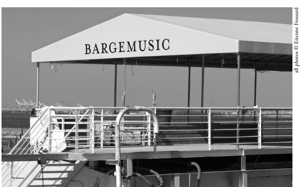
The impressive vistas from Bargemusic, with our newly unobstructed view of the Statue of Liberty.