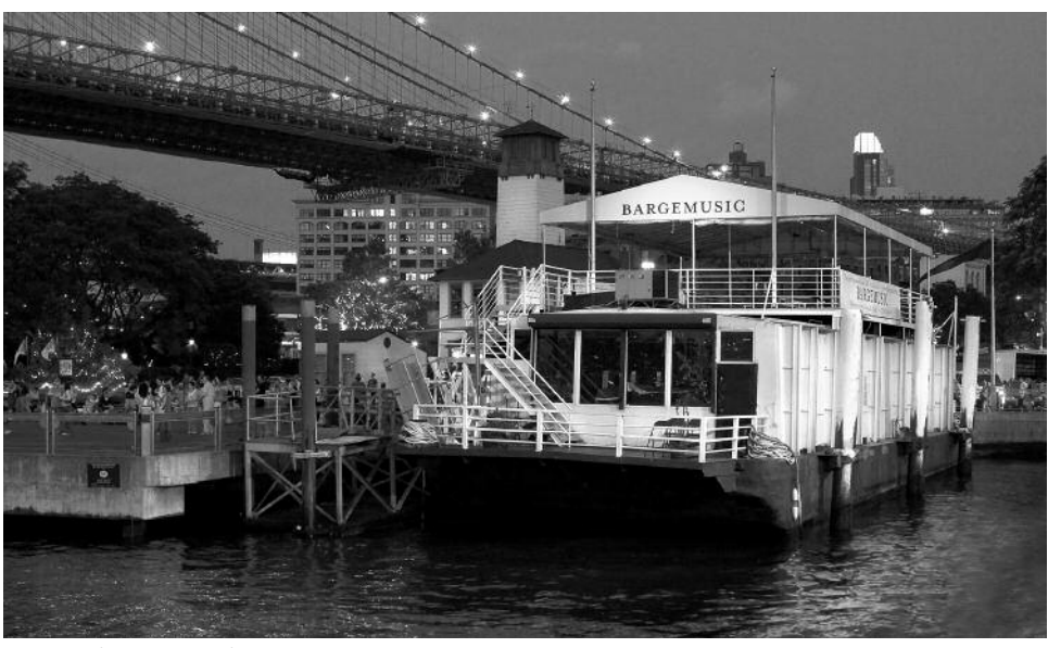
A view of Bargemusic from Pier 1.