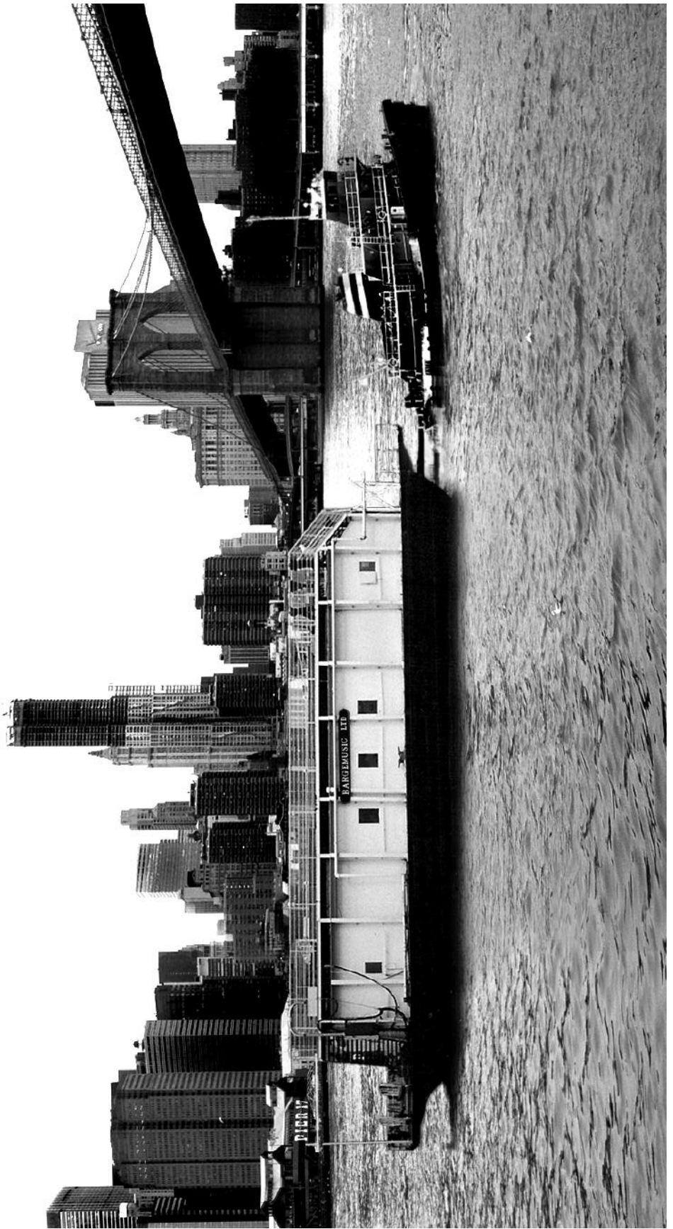
BargeMUSIC being towed along the East River to dry dock. Like any maritime vessel in New York City, the Barge must be lifted out of the water periodically for routine inspection and maintenance. The Barge will be in dry dock in New Jersey from March 29 through April 15; concerts will resume on April 16.